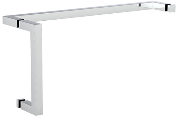
Offset Door Handle Shown with no Rosette